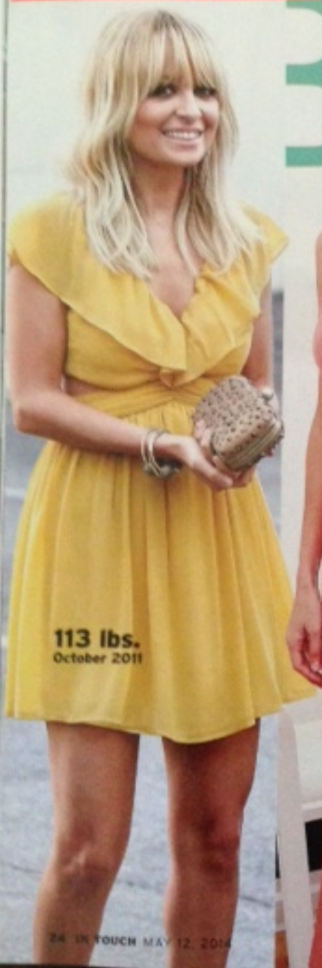
113 lbs. October 2011

So skinny their loved ones are getting scared! What