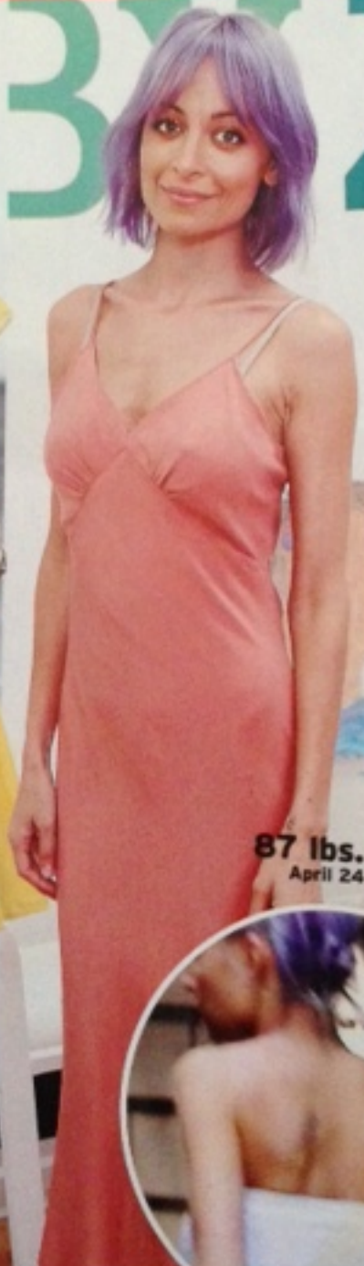
87 lbs. April 24